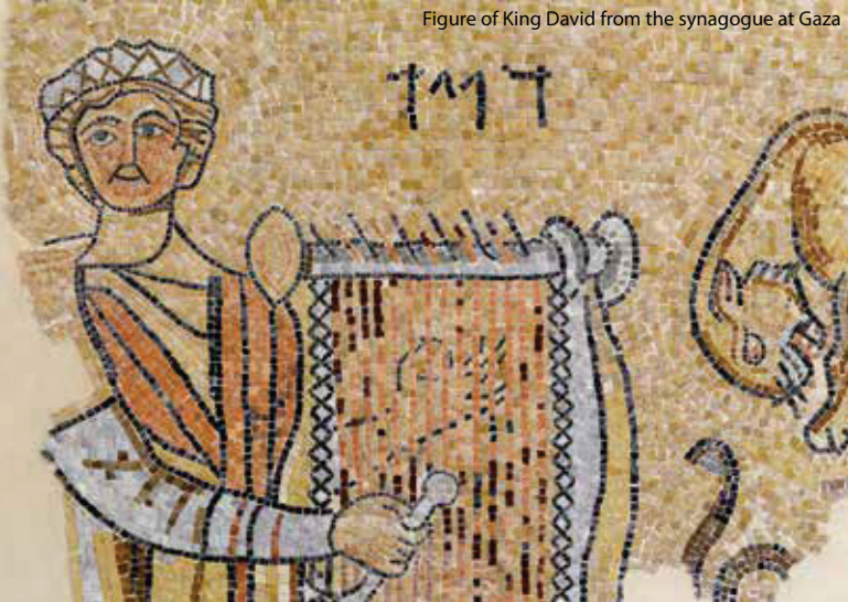
Figure of King David from the synagogue at Gaza

Lord our God, who long prepared the way for our salvation, give us hearts to love you and a will to seek your kingdom, where your true anointed king reigns in glory forever. Amen.